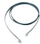
Model DCAC02 Cable Connection: For connecting multiple boards.