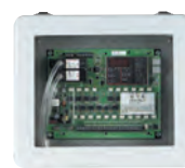
DCT in optional NEMA 4/4X weatherproof enclosure.