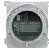
DCT in optional Explosion proof Enclosure.