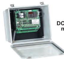
DCT expanded with multiple boards.