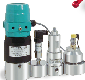
Stackable Pressure Components