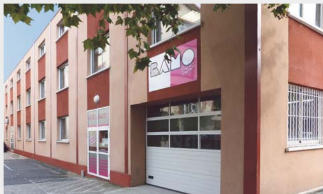
BAMO Mesures SAS Headquarters, France ISO certified company Registered n°: 2010092106