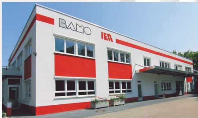
Bamo IER GmbH German factory ISO certified company Registered n°: 08 100 013102